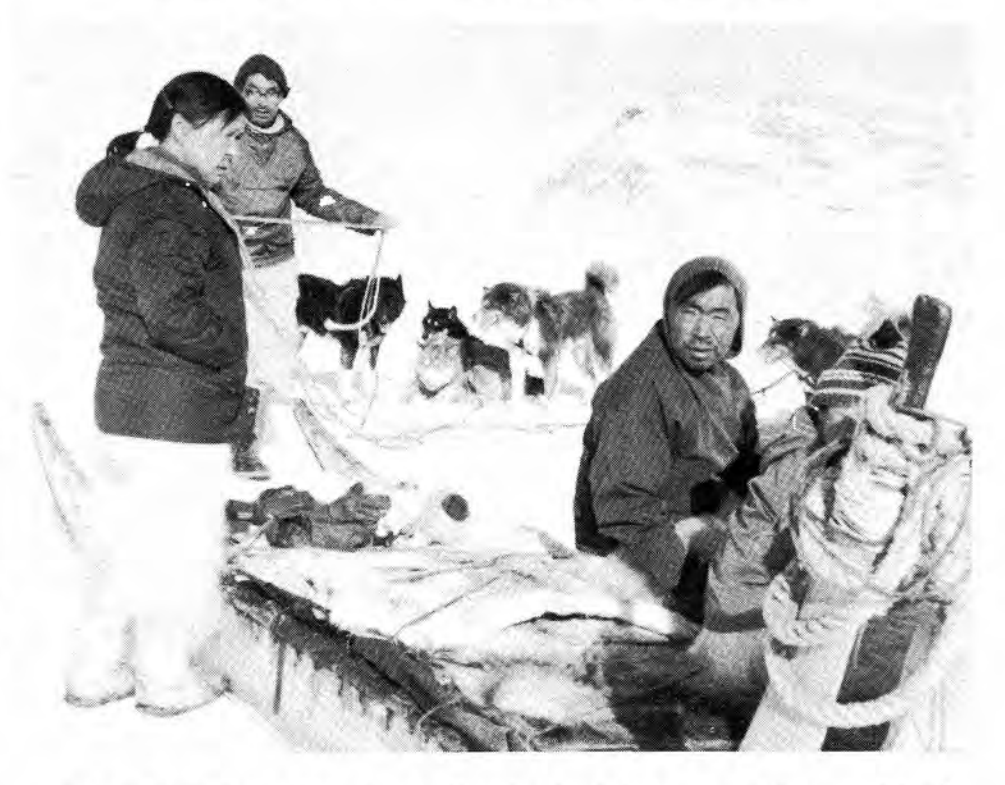
ESKIMOS at Thule, Greenland, offered to lend dog teams to the expedition but the hardy huskies were not needed.